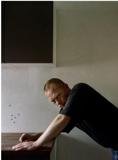
Man leaning at table, 2004