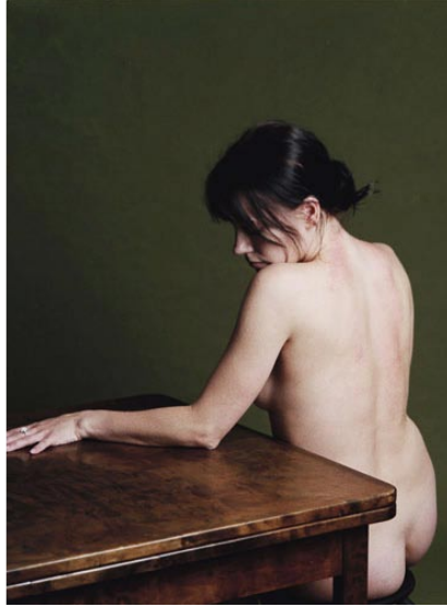
Woman with a rash at table, 2004

The work of Signe Vad (1967, Denmark) turns around the human body and identity. It tells stories about gender, the relationship between mind, body and beauty, loneliness, weakness and strength, inadequacies and self-sufficiency. The choice of accessories and environments translates the interrogation of the artist of the relations which bind a body to the world and leaves upon it, and within it, shadows, traces and signs: its story.