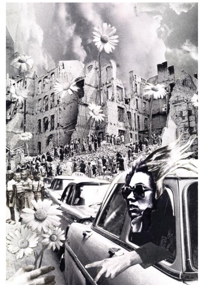
Letzter gruss 2006

The traumatic experience of World War one, its battles in the drenches of Ypres and Verdun, growing mega-cities with mass unemployment, rigid capitalism and violence were forceful sources of inspirations to comment on the position of mankind. The glittering world of big cities with its losers and winners, flaneurs and delinquents became a central topic of the arts.