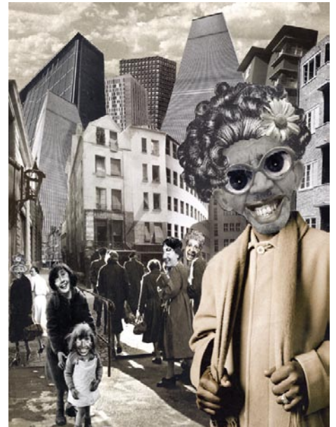
Der böse Onkel. Euch wird das Lachen schon vergehen 2006

The subjects of Nikolas Tantsoukes' works are widespread, and range from deconstructed portraits to visions of dream sequences, which show some resemblance, if any, to the collage-books of Max Ernst. Unparalleled are the cityscapes, in which the artist embeds his narrations.