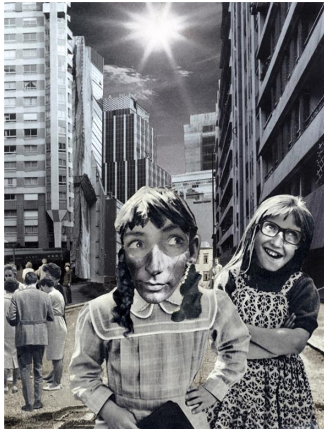
... und aus dieser kurzen Begegnung wird bald Freundschaft... 2006