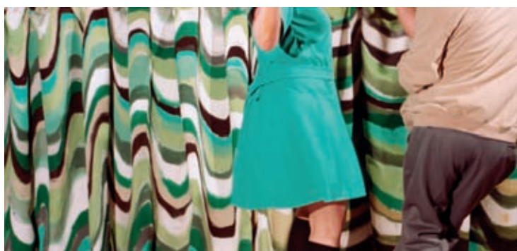
Grüner Salon II, 2004, C-Print / Diasec / Aludibond