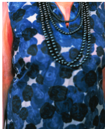
Frieda II, 2006 C-Print / Diasec / Aludibond

Dehnel's photographic works describes another step within her investigation of the reality character of images. The situation presented in her painting is now used as an opportunity for its photographic new production. In this process, the painting assumes the role of the model for a serial modification of the shown moment. For this purpose, a real person is positioned in a setting designed by the artist, which is copied from the surroundings shown on the original photograph. Then, clothes and props are produced and the model's skin is made up with colour. It is true that the model wears different costumes but the pose will always be the same so that, when looking at the series of photographs, the individual pictures will overlap in the mind and finally melt into a complex matrix of memories. In Dehnel's work, painting and photography do not compete with each other but form a perfect couple to complement their statements on the truthfulness, perception and construction of medially imparted realities.