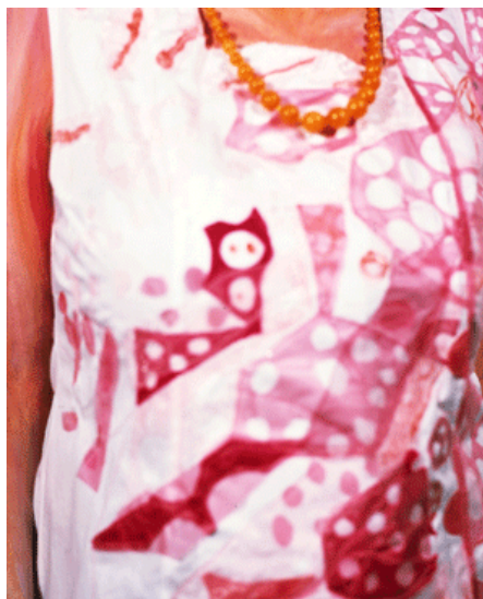
Frieda I, 2006 C-Print / Diasec / Aludibond